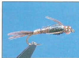
Flashback Pheasant Tail