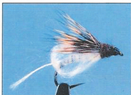
Emergent Sparkle Pupa